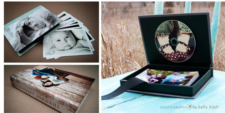
5x7 custom image box

What a beautiful and classic way to preserve your portraits for years to come. Each box is custom designed with images from your session. Inside, you will find a quality 5x7 print of each image from your gallery.